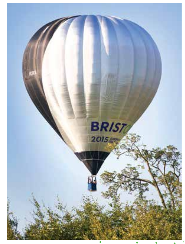
The Bristol 2015 Solar Balloon

The event achieved widespread local, national and international media coverage, with a total reach of nearly seven million people. The solar balloon was covered in 61 articles, and national coverage highlights included The Guardian, Telegraph, Daily Express, Sunday Times, Mail Online, BBC News and Huffington Post. Further media coverage will occur in 2016. A production company for BBC Two followed the balloon's journey from conception, for an episode in a highly anticipated new series that is expected to attract around two million viewers.