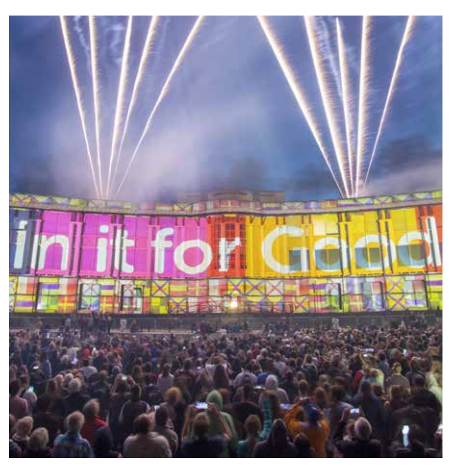
The 'In it for good' light show – Harbour Festival 2015

These commercial arrangements were a mixture of financial and value in kind support and totalled £4.25 million. Their commercial sensitivity means that the details of individual sponsor contributions are not in the public domain.