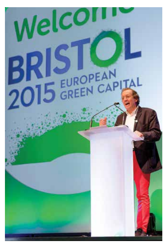
Opening Ceremony, The Victoria Rooms