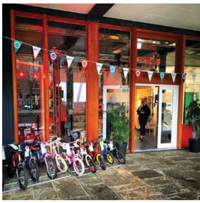
Bristol 2015 Lab & Office